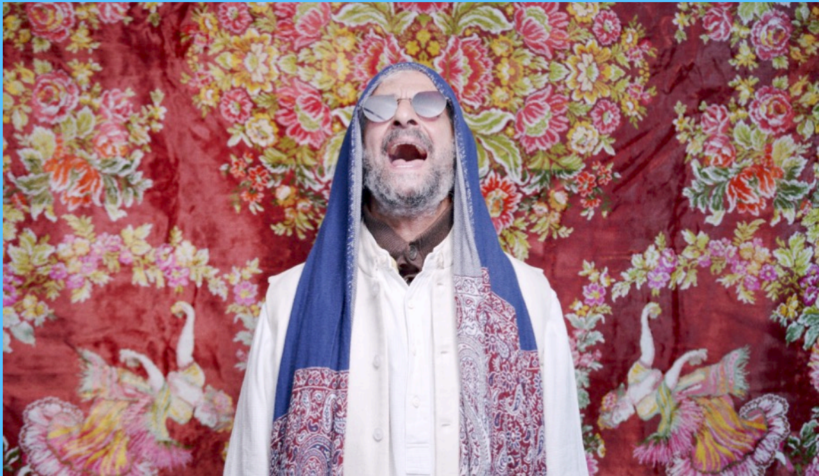
Frame from 'To box with god'