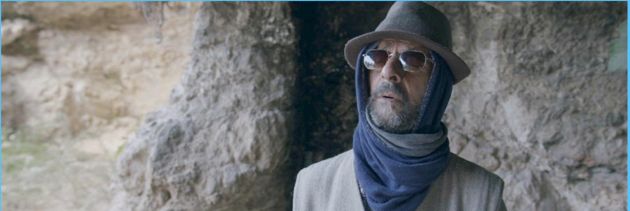
Frame from 'To box with god'

The film, about 30 min. in length, is the first collaboration between JOJO and Cohen, who met in Jerusalem's Moroccan scene and discovered they were neighbours, forming a strong bond of friendship. The short distance between their homes allowed them to continue working together in Amit's studio even with the Covid-19 restrictions. The soundtrack to the film will be released in the near future as an EP.